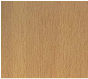
Golden Beech 7350 NC